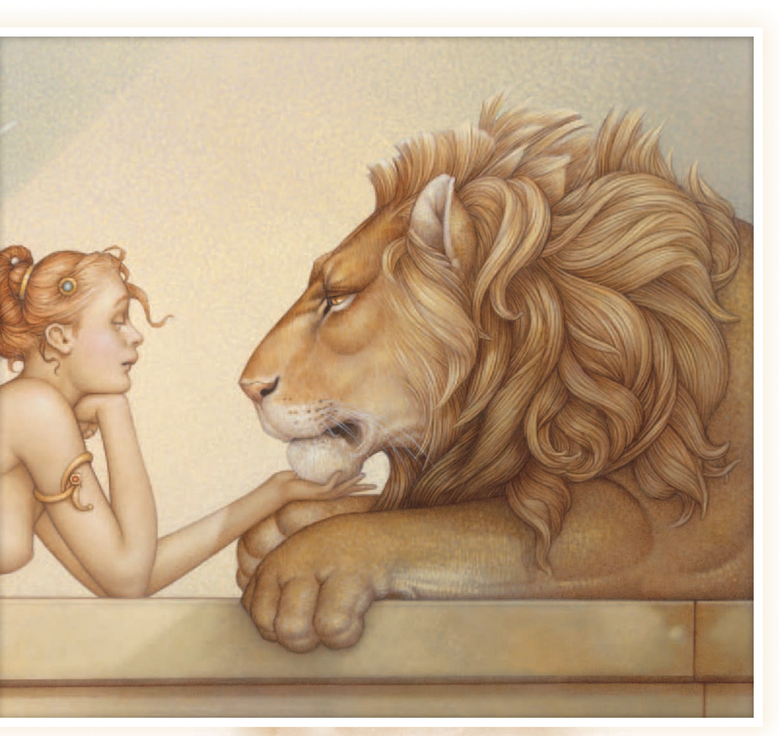
GOLD 17.5 x 39.5 inches | Fine Art Edition on Canvas