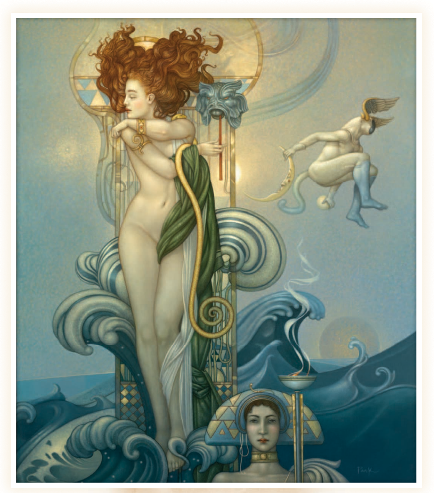
VENUS 39.75 x 32.5 inches | Fine Art Edition on Canvas