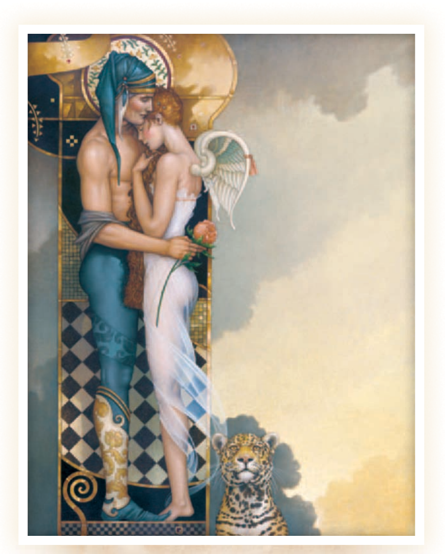
THE LAST PEONY 42 x 32.5 inches | Fine Art Edition on Canvas