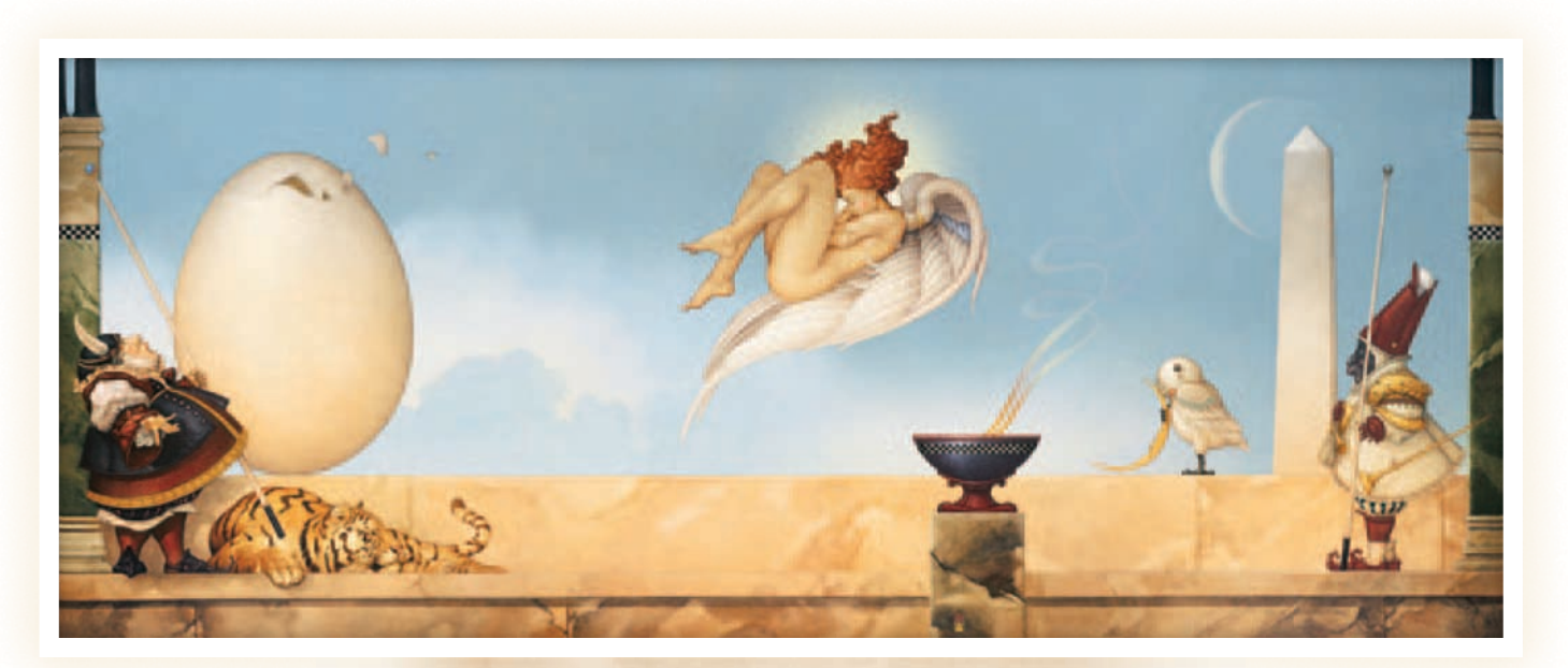
ETERNITY 17 x 42 inches | Fine Art Edition on Canvas