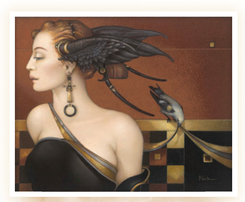
BLACK ORCHID 12.5 x 16 inches | Fine Art Edition on Canvas

Magical realism – is not a realism to be transfigured by the supplement of a magical perspective, but a reality which is already in and of itself magical or fantastic. Magical realism turns out to be part of a twentieth-century preoccupation with how our ways of being in the world resist capture by the traditional logic of the waking mind's reason. The magical realists' reveal the intimate interdependence between reality and fantasy. Magical realism transforms the ordinary into the extraordinary.