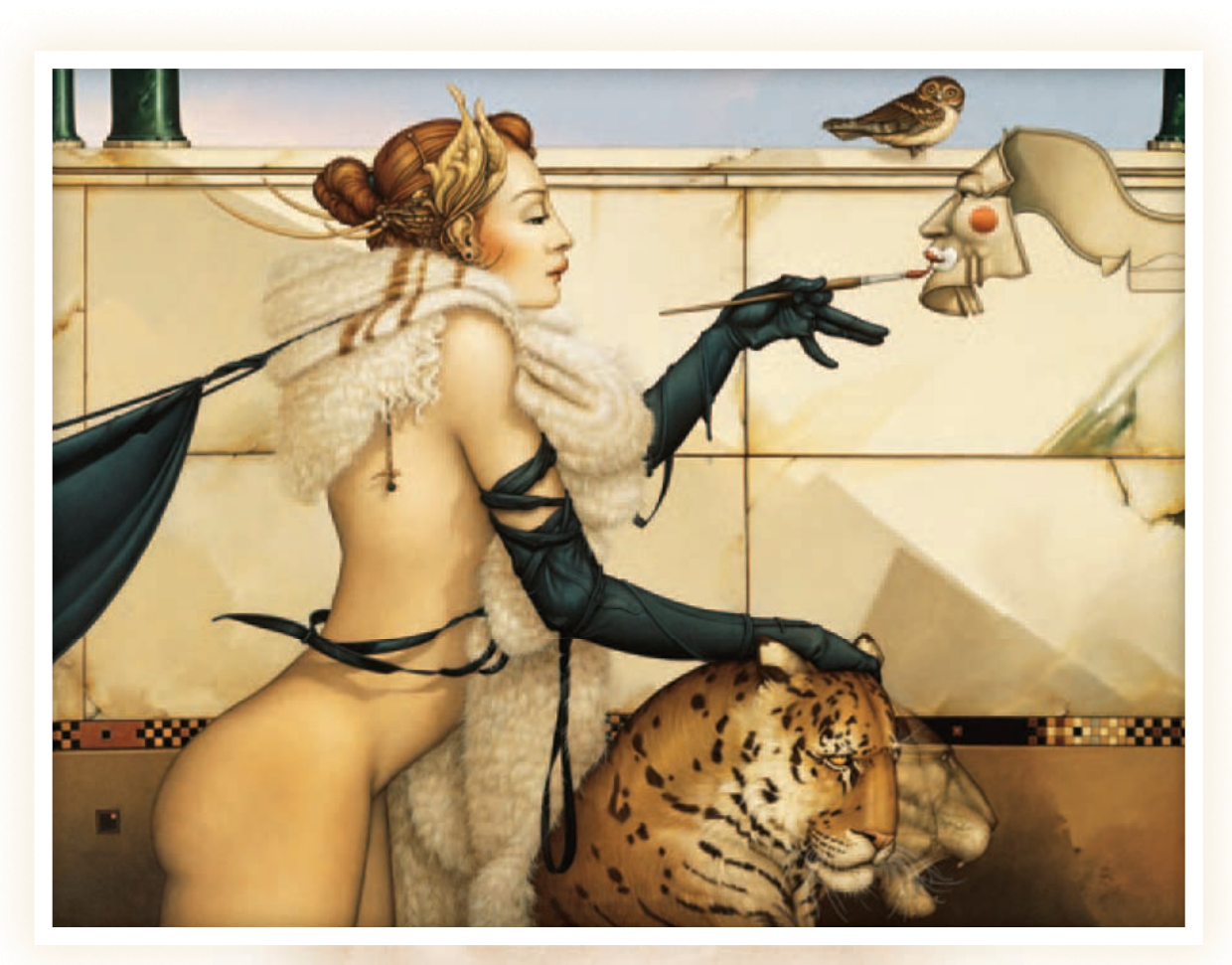
THE CREATION 29.5 x 39.5 inches | Fine Art Edition on Canvas