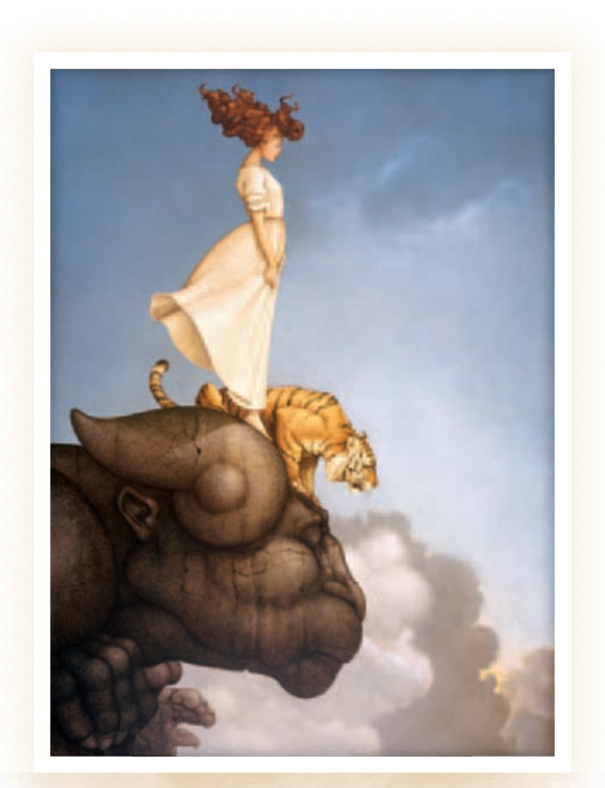
SKY MEDITATION 27 x 20.5 inches | Fine Art Edition on Canvas