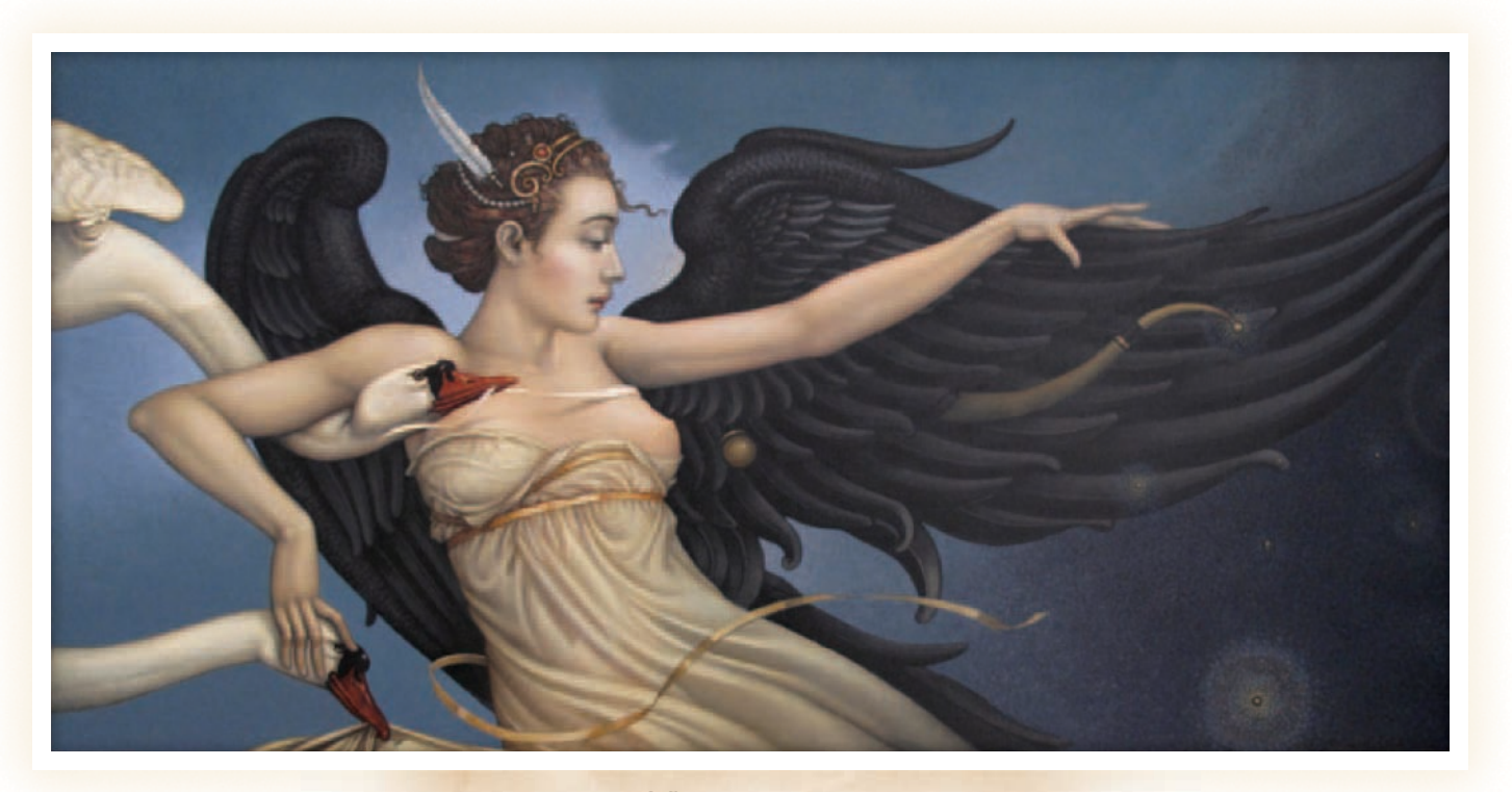
NIGHTFALL 17 x 33.5 inches | Fine Art Edition on Canvas