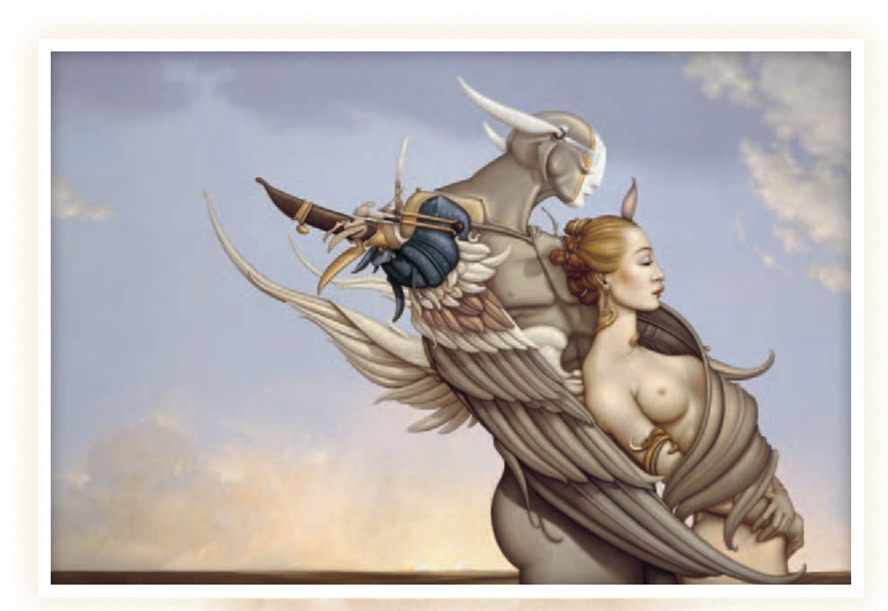
DIAMOND WARRIOR 22 x 30 inches & 37 x 48 inches | Fine Art Edition on Canvas