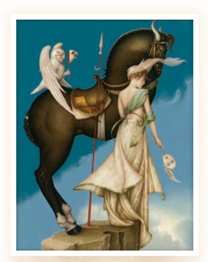
THE SUMMIT 24 x 19 inches | Fine Art Edition on Canvas