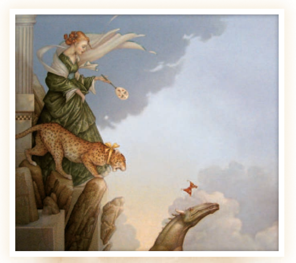
FEARLESS 24.5 x 27.5 inches | Fine Art Edition on Canvas