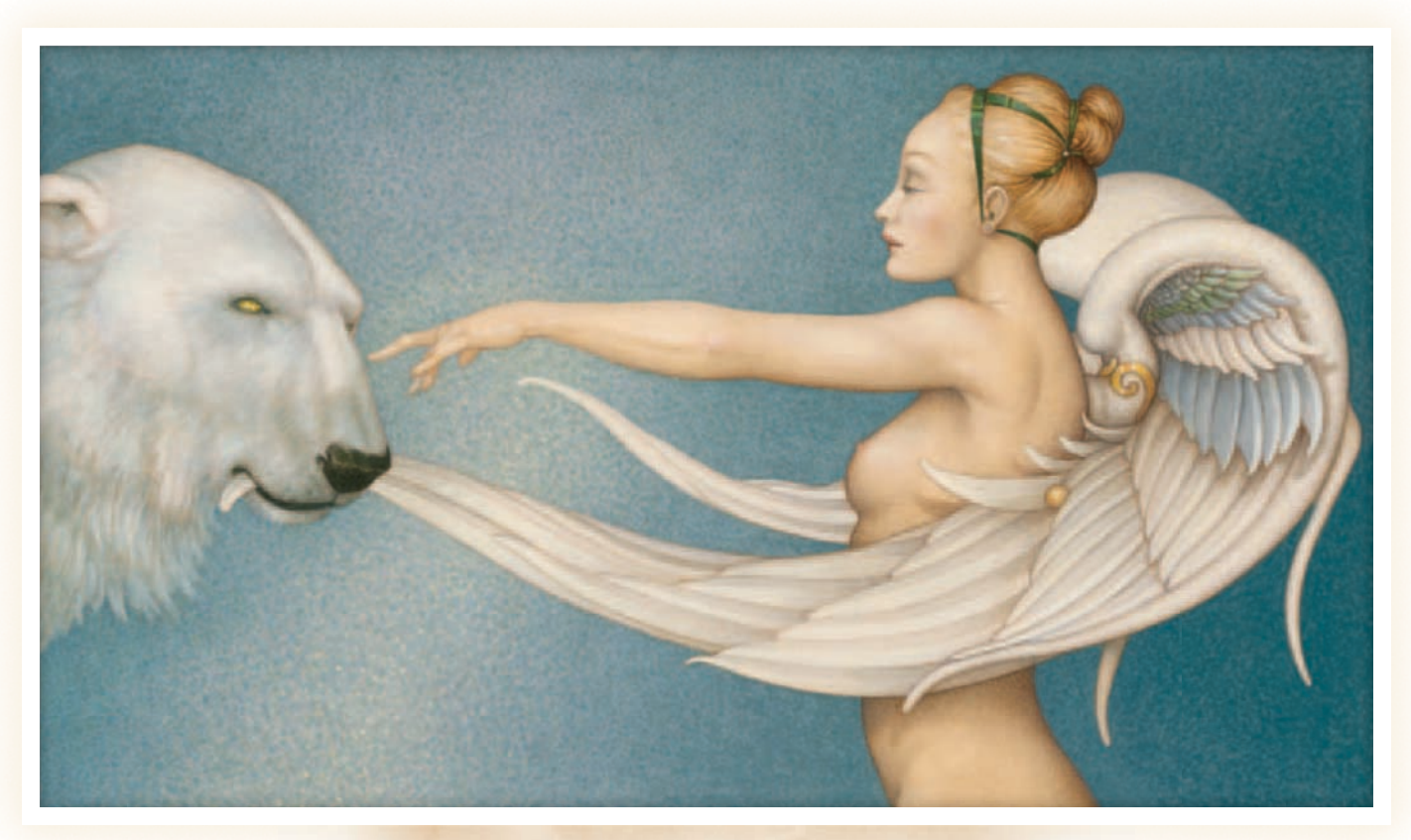
POLAR WINGS 13 x 22.25 inches | Fine Art Edition on Canvas