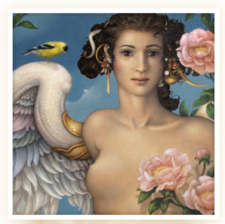
GOLDEN FINCH 15 x 15 inches | Fine Art Edition on Canvas